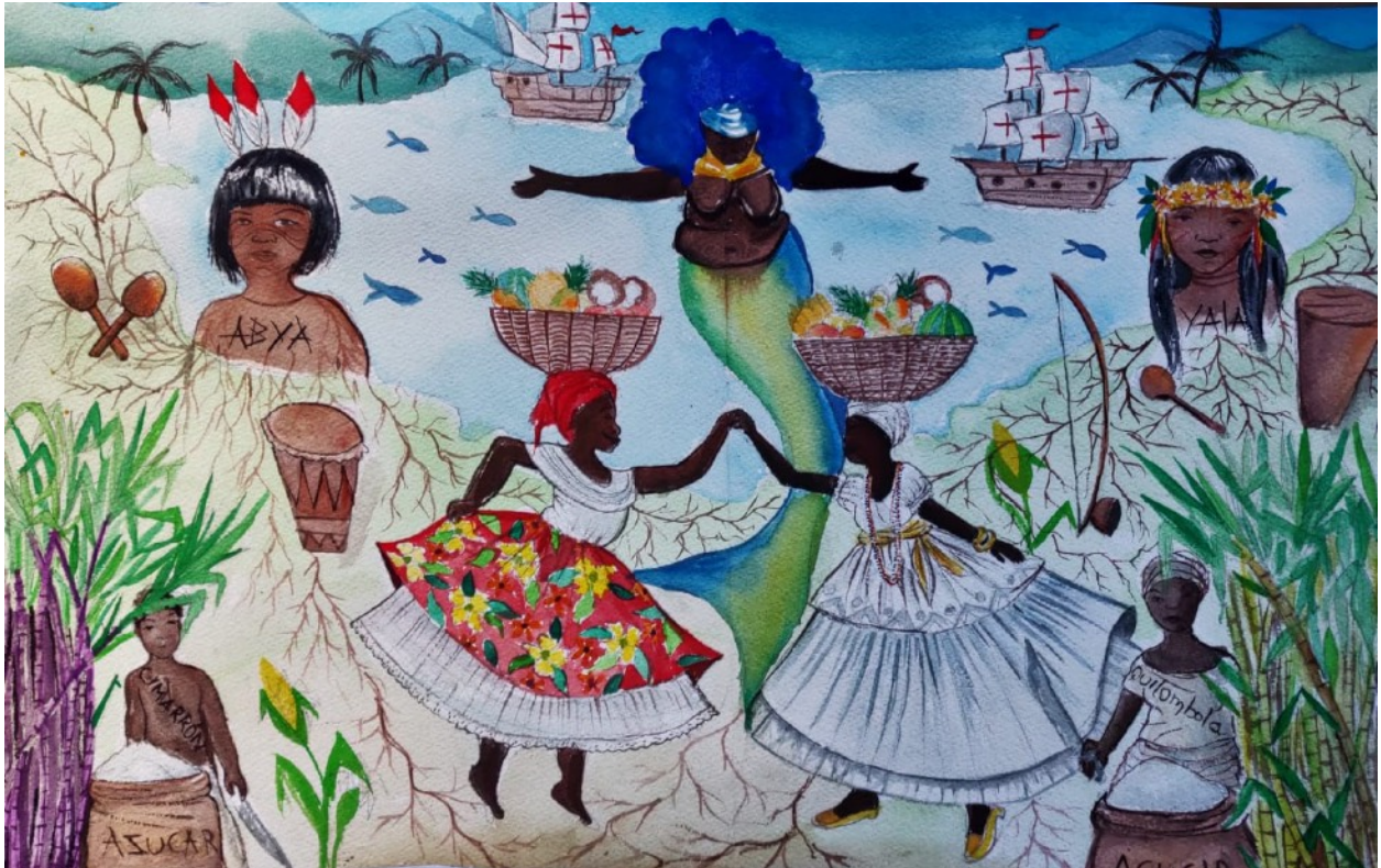
Salvador e Caribe