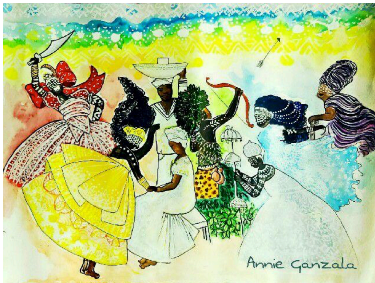
Confirmação para Ekede