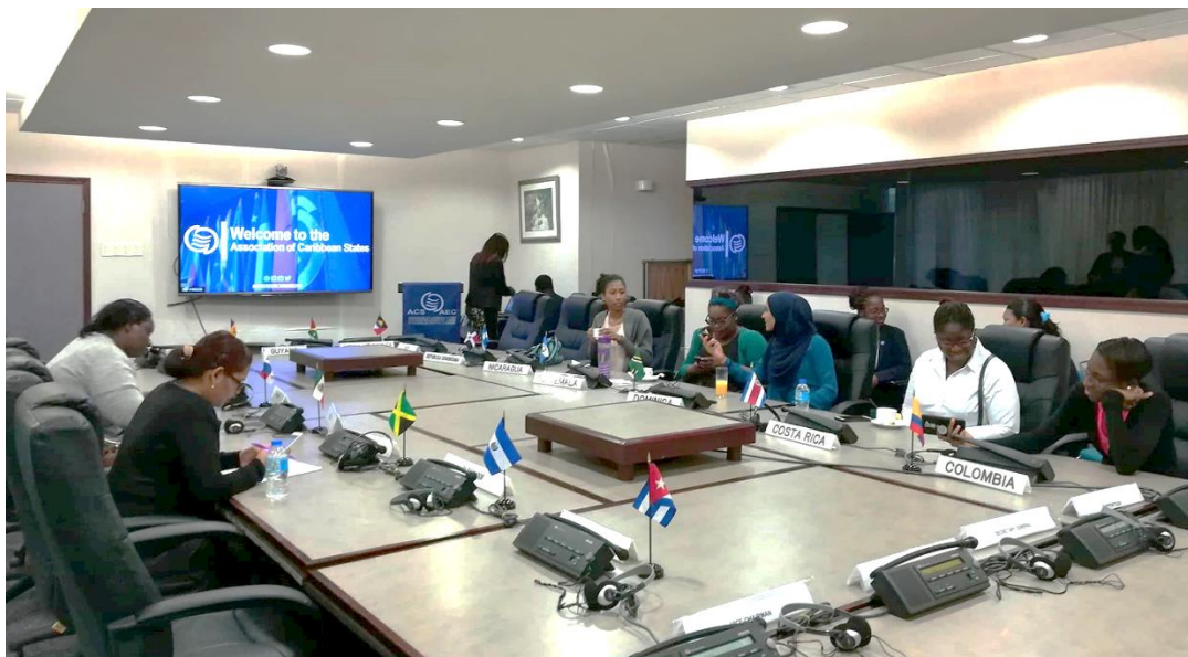
Figure 18: IIR Students visit to the Association of Caribbean States – April 27 2018