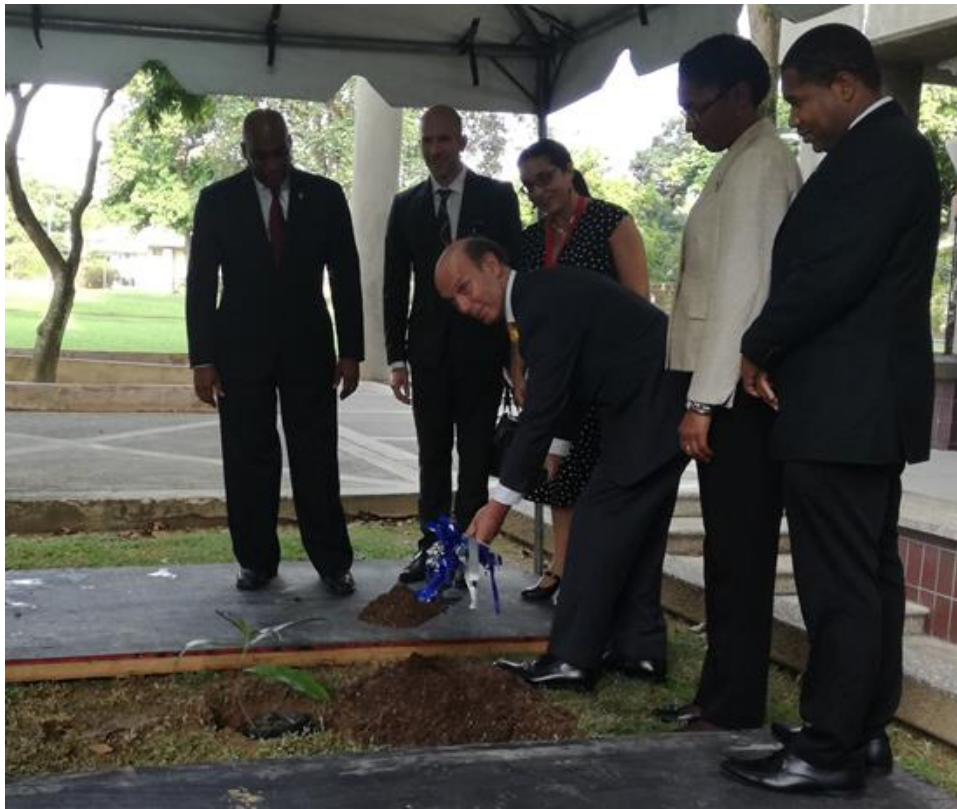
Figure 6: Members of the panel observe as His Excellency Javier Carbajosa Sánchez turns the sod at the symbolic 'Chaconia' Tree planting ceremony - November 9 2017