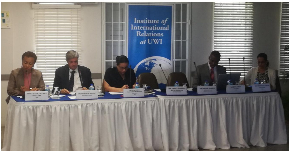
Figure 16: Participants of the "IIR Workshop on the Second Ministerial Meeting of the China-CELAC Forum" – April 19 2018