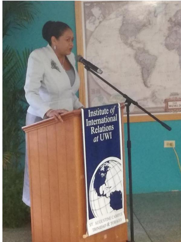
Figure 19: Figure 17: Ambassador Dr. June Soomer, Secretary General of the Association of Caribbean States presenting "Reducing Greater Caribbean Vulnerabilities Through Cooperation: The Case for the ACS" - April 30 2018