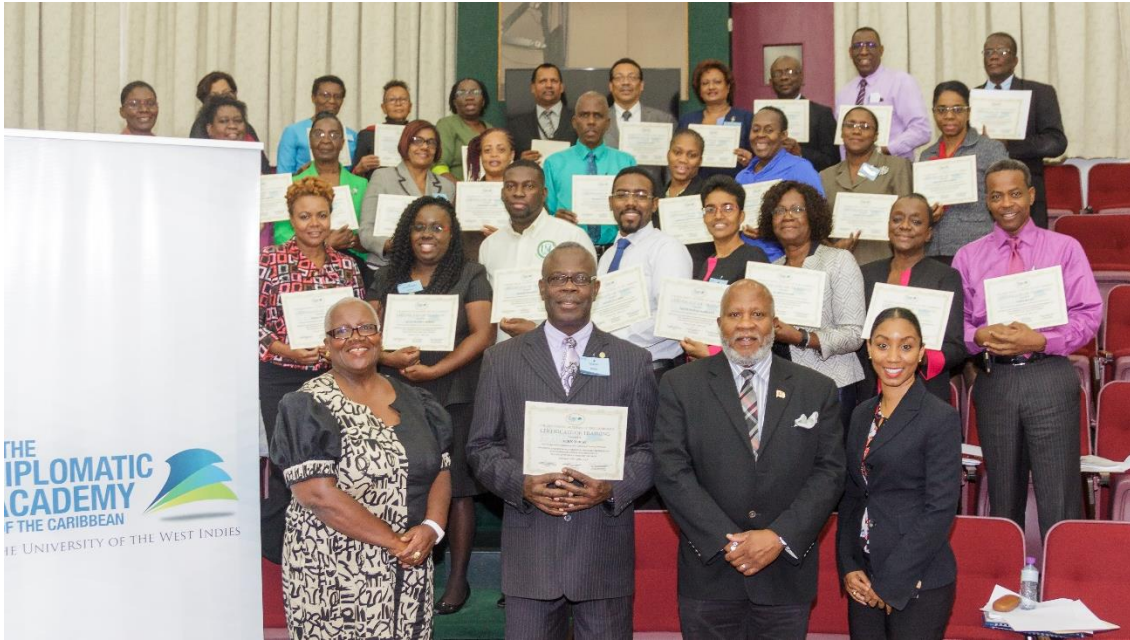
Figure 9: Protocol and Business Etiquette for staff of the Caribbean Union Conference of the Seventh-Day Adventist Church- November 28 2017