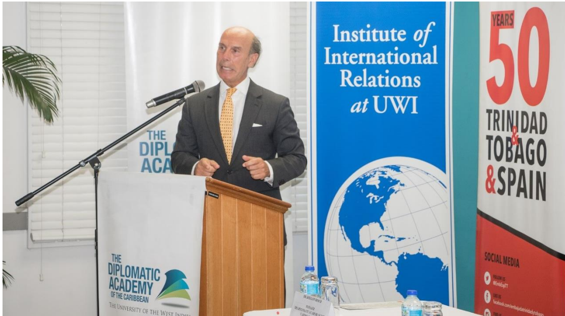
Figure 3: His Excellency Javier Carbajosa Sánchez, Ambassador of the Kingdom of Spain to Trinidad and Tobago delivers the Feature Address at Lecturer Room 1 of the Institute of International Relations (IIR) - November 9 2017