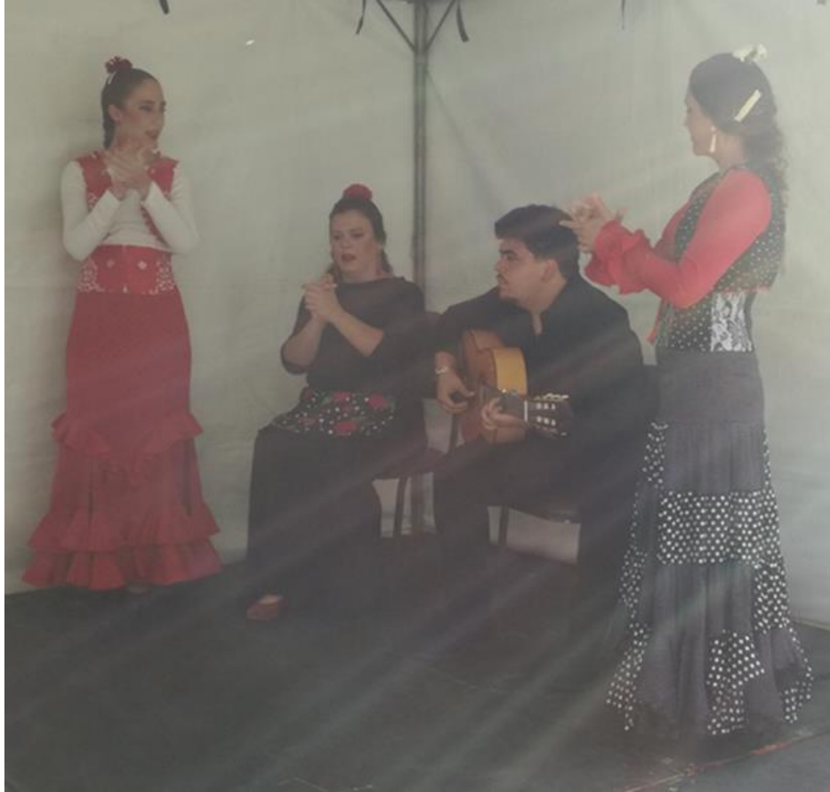
Figure 7: Members of the Cristina Heeren Foundation of Seville, Spain perform an entertaining flamenco piece at the cocktail reception- November 9 2017