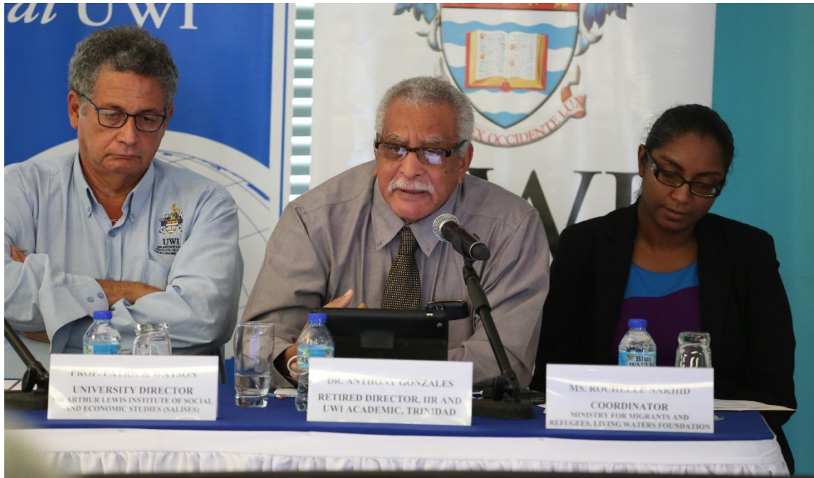
Figure 1: Panel Discussion on "Regional Perspectives on the Venezuelan Crisis" - September 12 2017