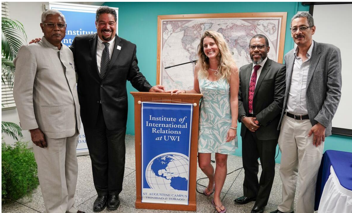
Figure 2: Panelists who presented at the Public Forum "How is Climate Change Affecting Small Islands and what can we do about it"- October 3 2017