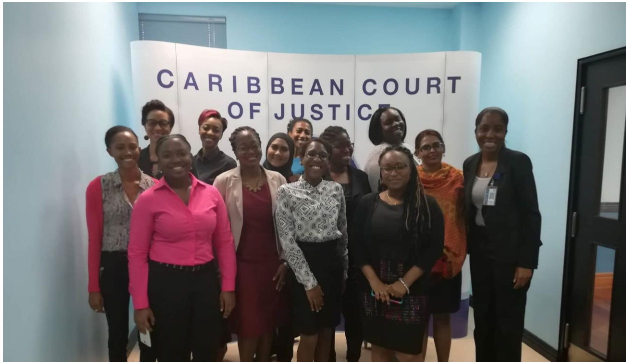
Figure 17: IIR Students at the Caribbean Court of Justice – April 26 2018